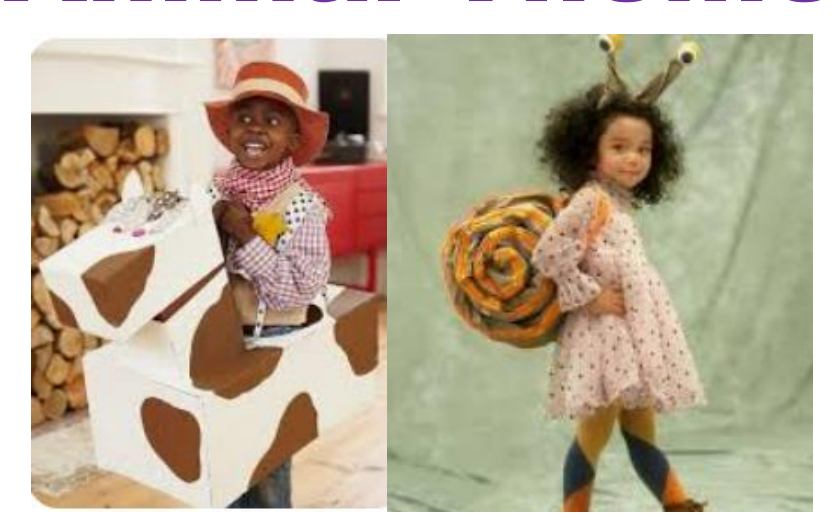
6pm-8pm Friday 28<sup>th</sup> March, 2025

Each student gets 2 pieces of Pizza and a popper for $6. Please put 2 tally marks to show which sort they would like